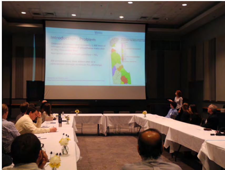
Students present research findings at the Annual Advisory Panel meeting, Leap Day, 2016.