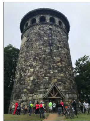
Cyclists at Rockford Tower

The Urban Bike Project, which cosponsored the event, supports the Wilmington community by providing access to bicycling as a healthy, affordable, and practical means of transportation and recreation. The DWRC is a steering committee member of the Clean Water Alliance, an initiative to educate people about the importance of clean water and a coalition of organizations and stakeholders working together across the state to secure funding for clean water.