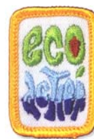
Girl Scout team tests nitrogen levels in stream water

New Girl Scout "Eco-Action" Interest Project Training was provided April 30th to 18 girls grades 6-12 by DWRC and UD Institute of Soil and Environmental Quality ( ISEQ ) staff for the first time at UD Ag Day.