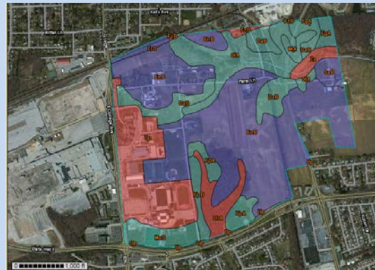
Figure 3. Map of USDA hydrologic soil groups (Hydric soils are hydrologic soil group D)