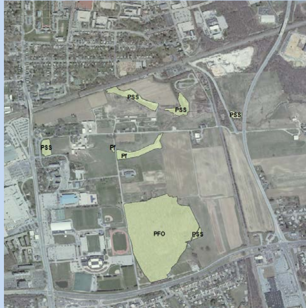
Figure 2. Updated GIS map of wetland bank on the UD Farm