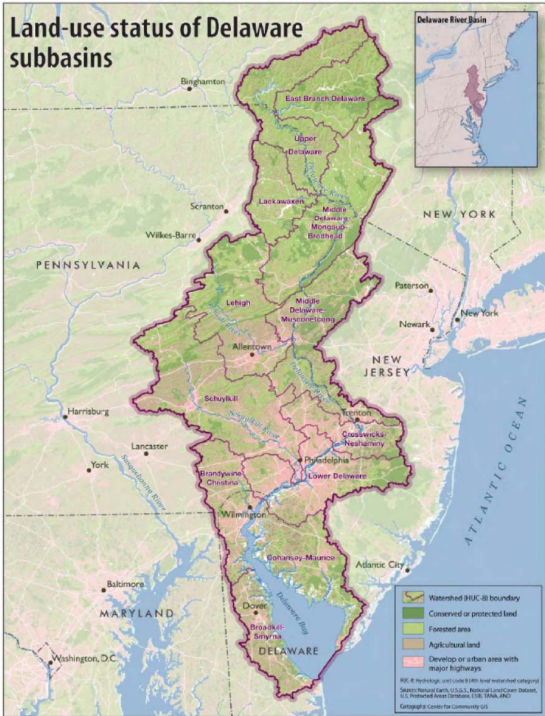
Figure 1. Delaware River watershed (OSI and WPF 2013)