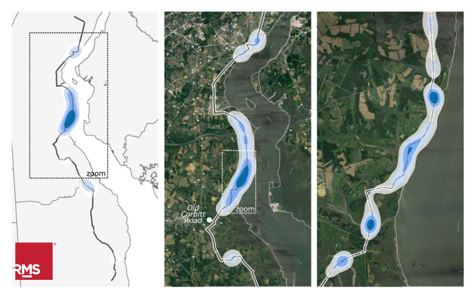
FIGURE 1 STORM SURGE MAP OF AVERAGE ANNUAL LOSS (AAL) FOR SR9

The efficacy of the Risk and Resilience Framework has been illustrated with a specific case study. That case study applies the risk quantification methodology to the risk presented to Delaware's State Route 9 from hurricane induced storm surge damage.