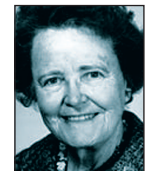
● The Patrick Principle: Ruth Patrick, the first environmentalist to serve on the DuPont Co. board of

directors, is known for developing the Patrick Principle. As The New York Times explained when she died in September at age 105, it means "the number and kinds of species in a body of water" indicate its health. She specialized in research on one-celled organisms called diatoms and was co-founder of the Stroud Water Research Center in Avondale, Pa.