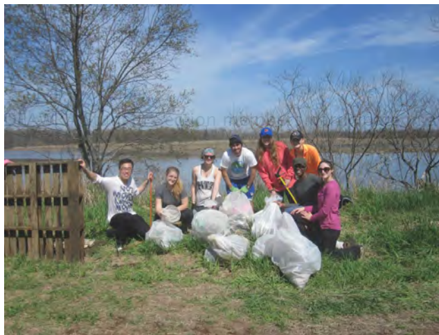
river clean up event in spring 2015.

2015 AWRA Annual Conference in Denver, CO. Past winners of the outstanding student chapter include the University of Florida, University of Wisconsin and Oregon State University.