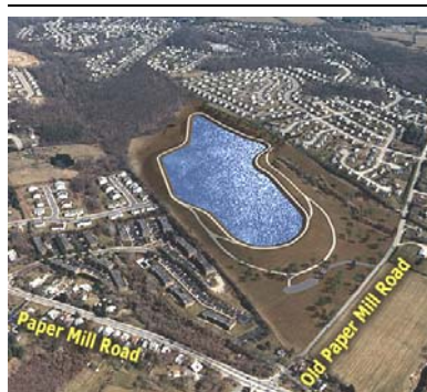
Proposed Newark Reservoir (317 mg)

Delaware's largest and only reserve water storage facility is the City of Wilmington's Colonel E. M. Hoopes Memorial Reservoir which holds 1.8 billion gallons of useable water, equal to about 2 to 3 months of reserve water storage. Hoopes Reservoir was constructed in 1932 for $3 million ($ 33 M in 2002 dollars). The reservoir work cleared 480 acres of land, making this one of the largest public works projects in Delaware history.